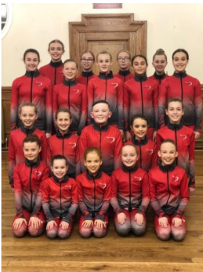
^ Our IDTA Tyneside Gala Team ^